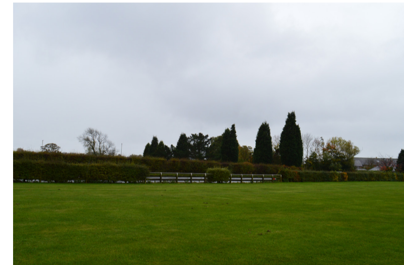
Mature hedgerow to car park.