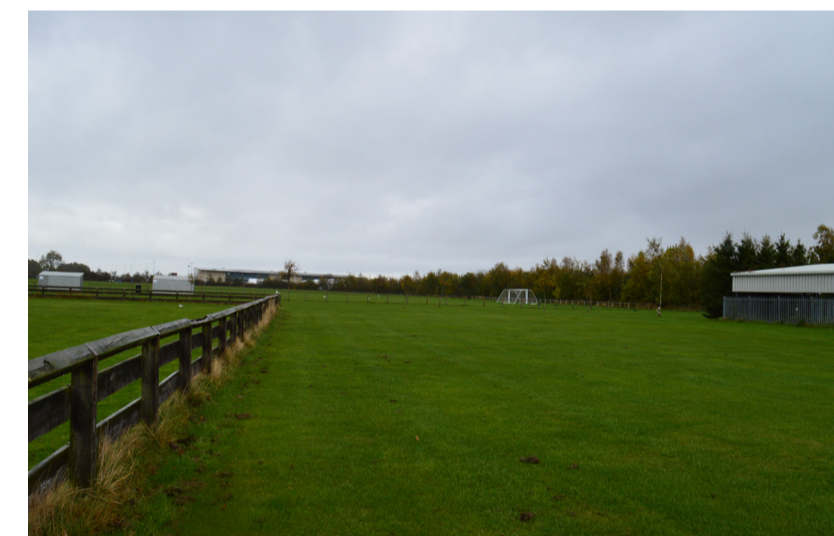
Mature vegetation to southern and eastern boundary.