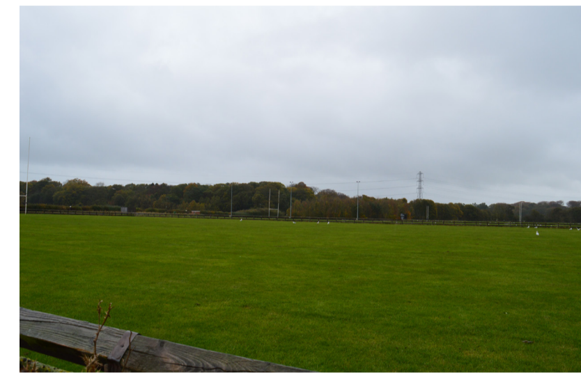
Mature woodland to the north of site.