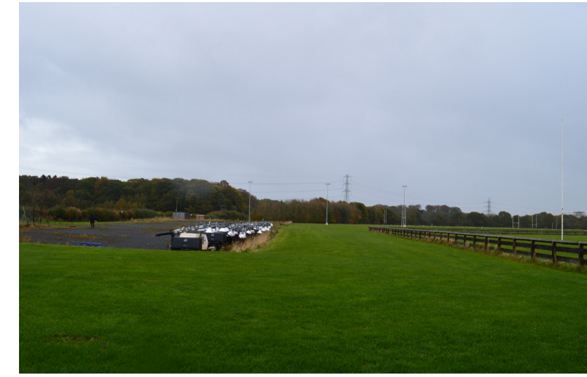
Mature woodland to the north of site.